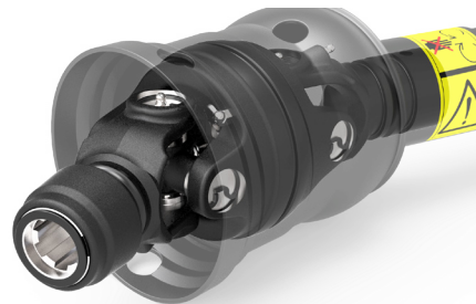
PATENTED COMPACT, ARTICULATED GUARD SYSTEM ANGLED UP TO 80°