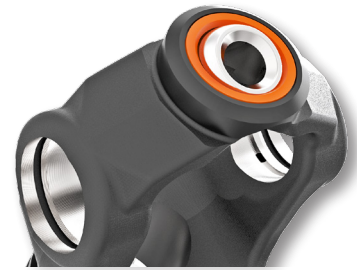
PATENTED HARDENED, SEALED SPHERICAL BALL AND SOCKET