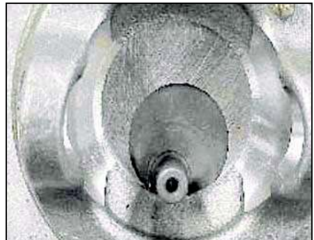
NEW UNUSED CENTER HOUSING

Weasler Engineering, Inc. P.O. Box 558, West Bend, WI 53095 USA Tel: +1-262.338.2161, Fax: +1-262.338.3709 E-mail: oemsales@weasler.com web site: www.weasler.com