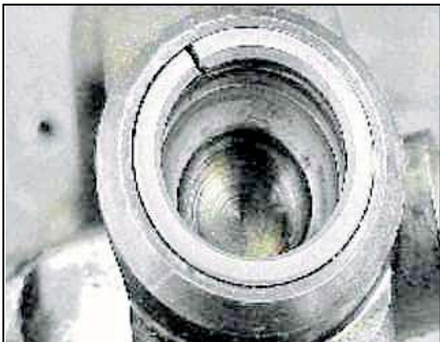
BALL & SOCKET YOKE